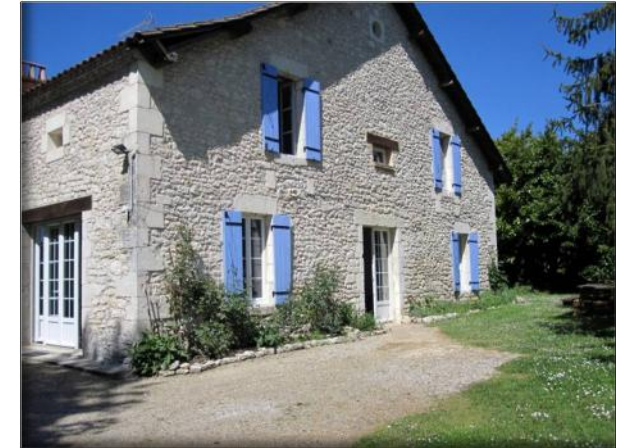
La Métairie ***